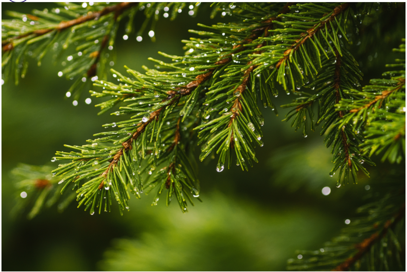
Close-up of Nootka tree bark and needles glistening with morning dew, signifying the source of the essential oil – under the section

Delving into the characteristics of Nootka tree essential oil unveils a plethora of fascinating qualities. The oil is well-regarded for its unique consistency, which is both smooth and slightly viscous. This allows it to blend effortlessly with other essential oils, enhancing its versatility in a variety of applications.