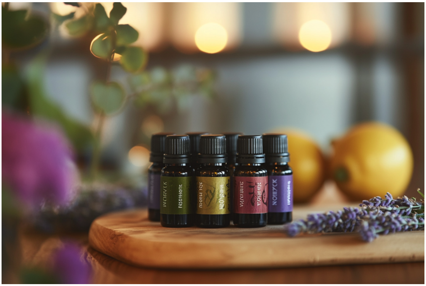
A beautifully arranged blend of Nootka tree essential oil bottle with other complementary essential oils like lavender and lemon

Blending Nootka tree essential oil with other oils not only enhances its aroma but also amplifies its therapeutic benefits. By carefully selecting complementary oils, you can create blends that support focus, relaxation, or energy. For specific targeting, you might opt for calming blends that incorporate lavender and sandalwood, or for invigorating combinations with lemon and bergamot.