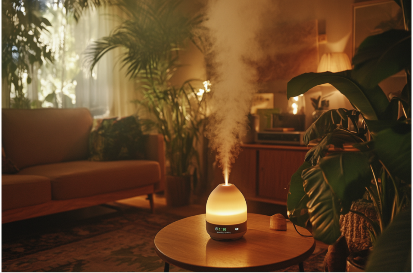
An inviting scene of a diffuser releasing a gentle mist of Nootka tree essential oil in a cozy, well-lit room