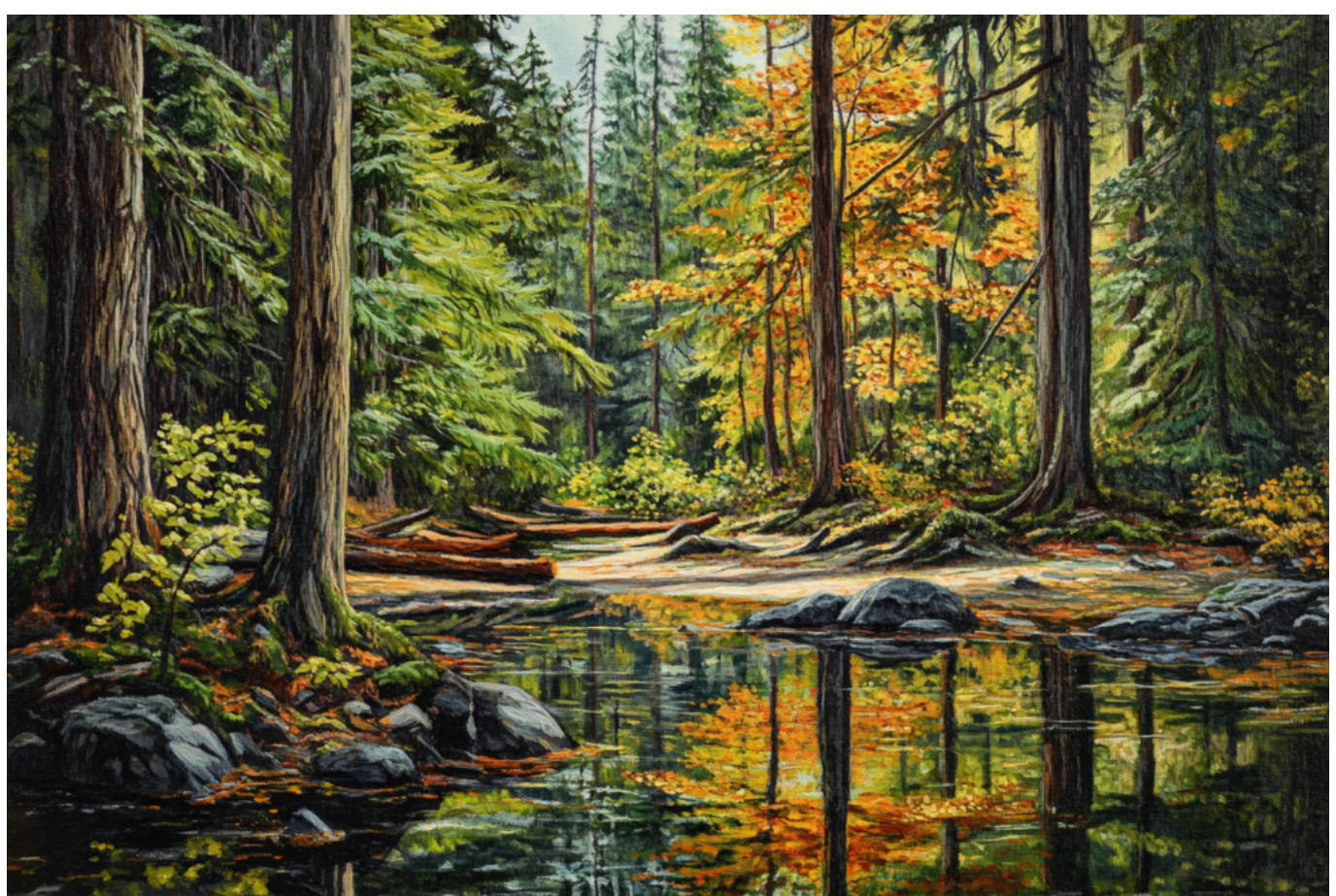
A serene forest landscape with a focus on Nootka trees, capturing their towering presence and lush leaves

Recommend Brands: Nootka Tree Essential Oil by Barefut