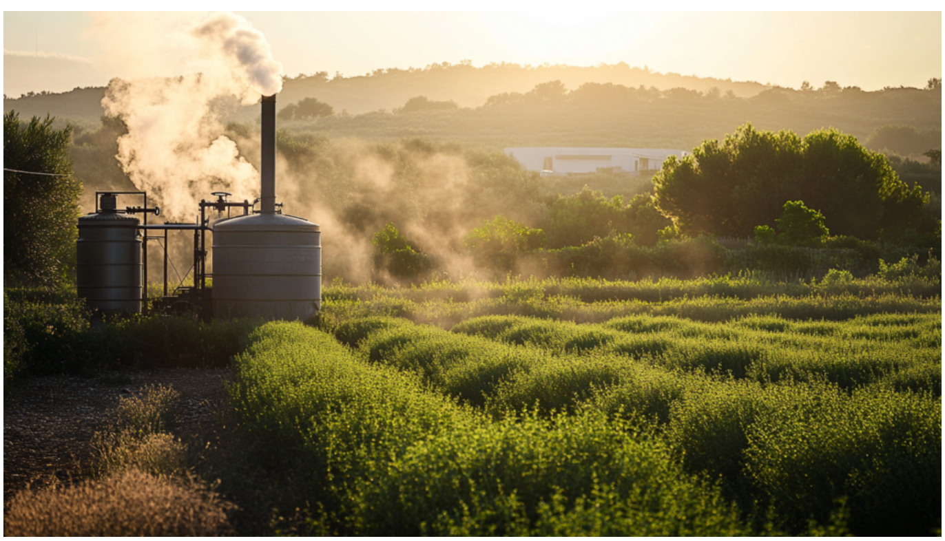
Rustic Mediterranean landscape with fields of green oregano plants

Imagine small, vibrant green oregano leaves meticulously harvested, then slowly heated with steam to release their precious oils. As the steam rises, it carries the oil vapors into a condensation chamber, where they are cooled and collected. This time-honored method ensures that every drop of oregano oil retains its powerful properties.