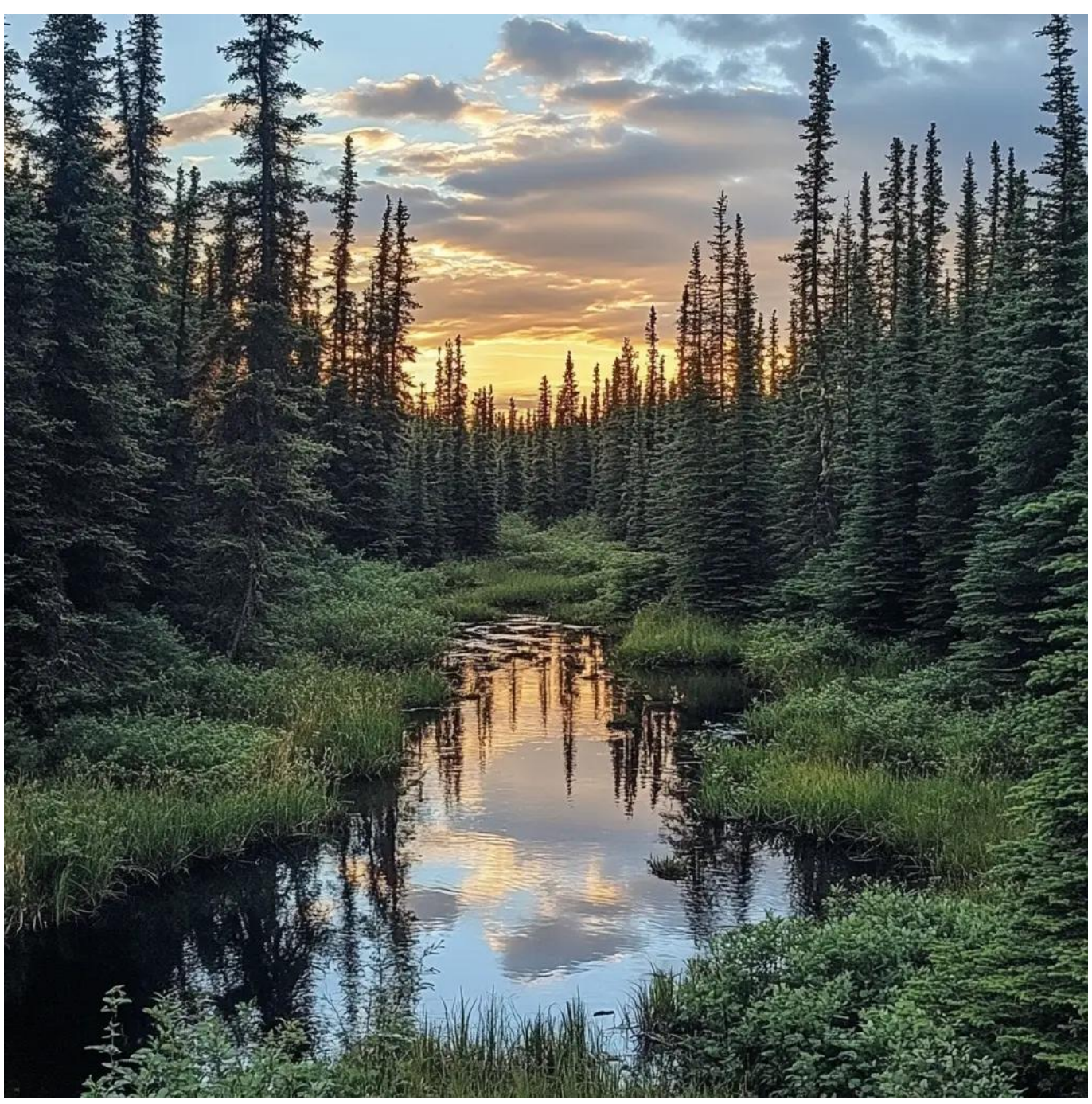
A serene image of dense North American forests with Black Spruce trees, showcasing the natural habitat of the origin of Spruce Black Essential Oil