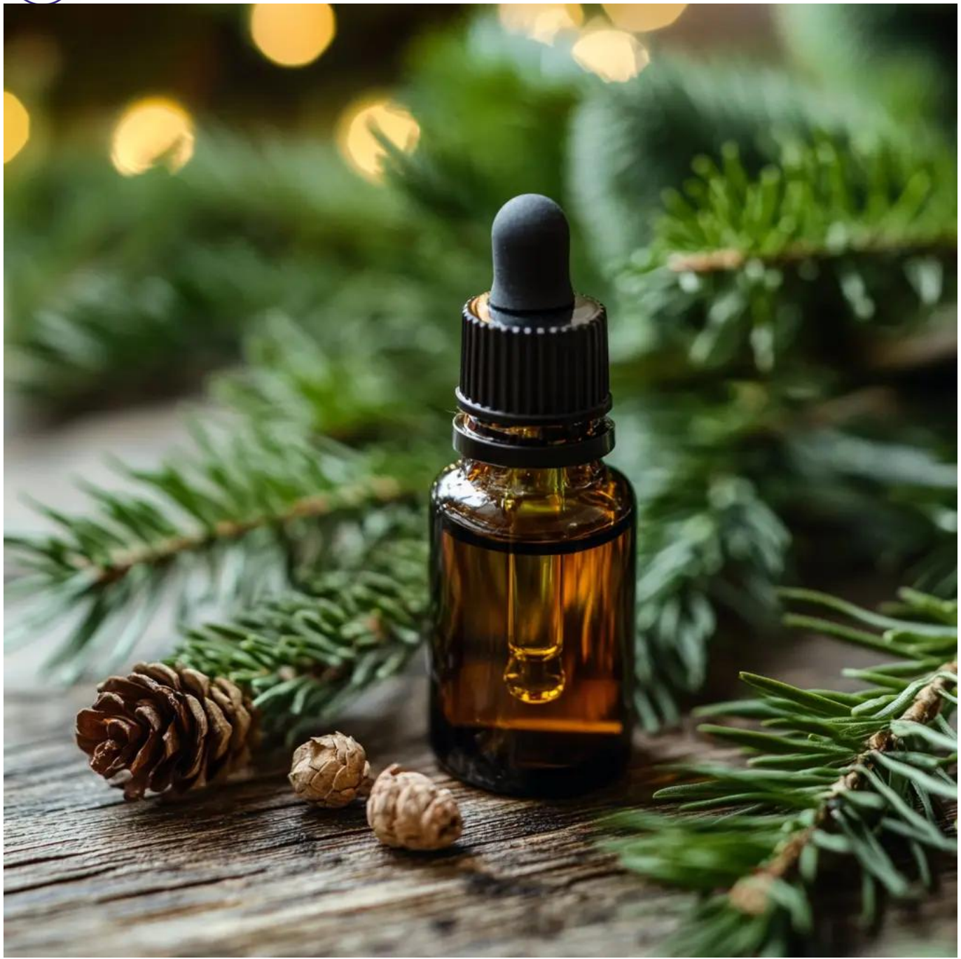
A detailed close-up of Spruce Black Essential Oil bottle on a wooden table, surrounded by spruce needles and twigs.