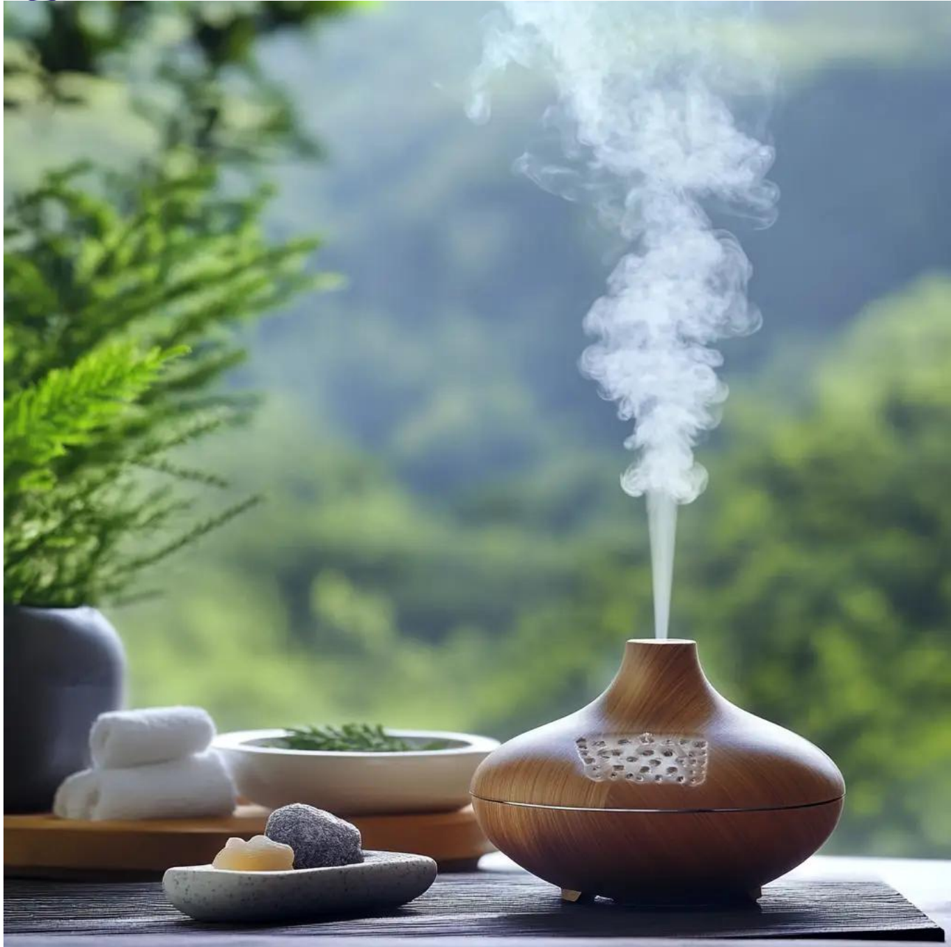
A calming scene of a spa setup with a diffuser emitting a mist of Spruce Black Essential Oil against a backdrop of tranquil nature